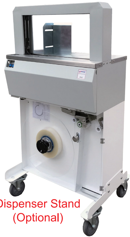
Dispenser Stand (Optional)