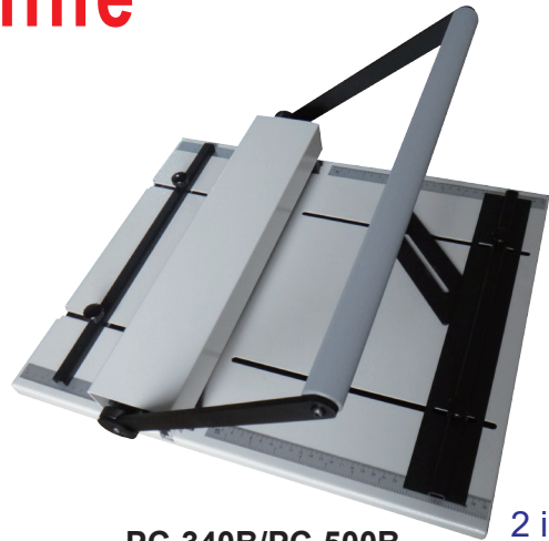
PC-340B/PC-500B 2 in 1 Creasing & Perforating